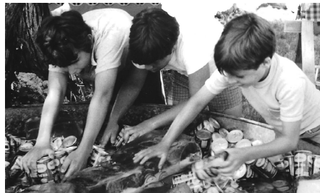
Ice cold pop