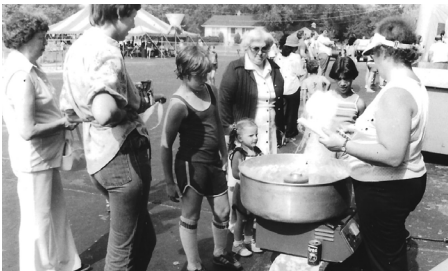
Cotton candy machine