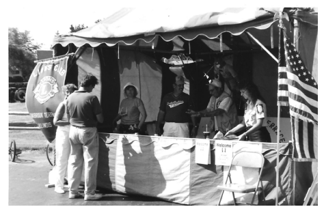
Lions Club tickets