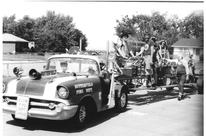
Getting ready for the parade